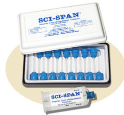
Cat. No. 58-03

CAUTION: Dentin sealer contains flammable solvent.